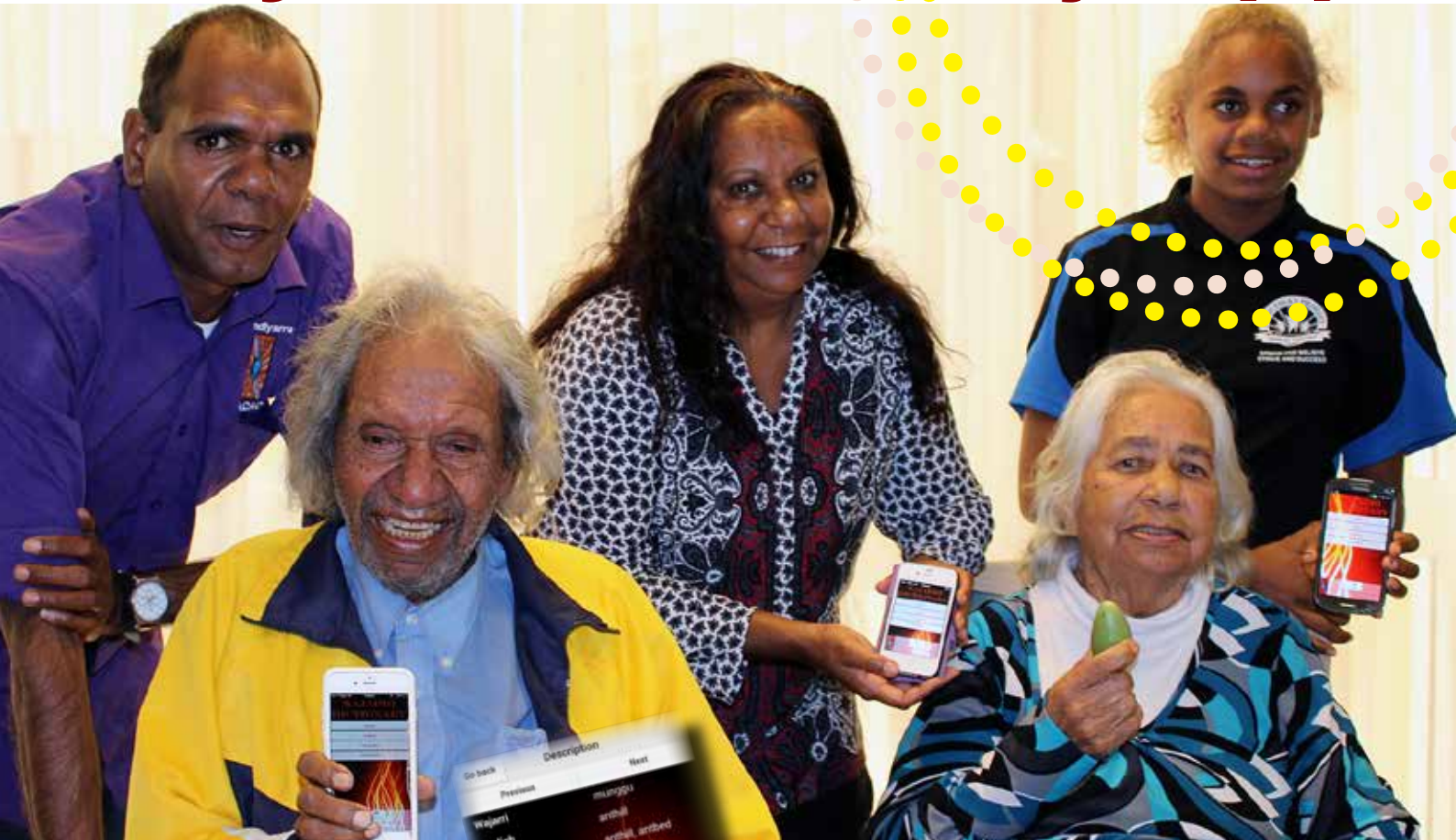
Three generations with the Wajarri Dictionary App (and a gargula or bush pear!)